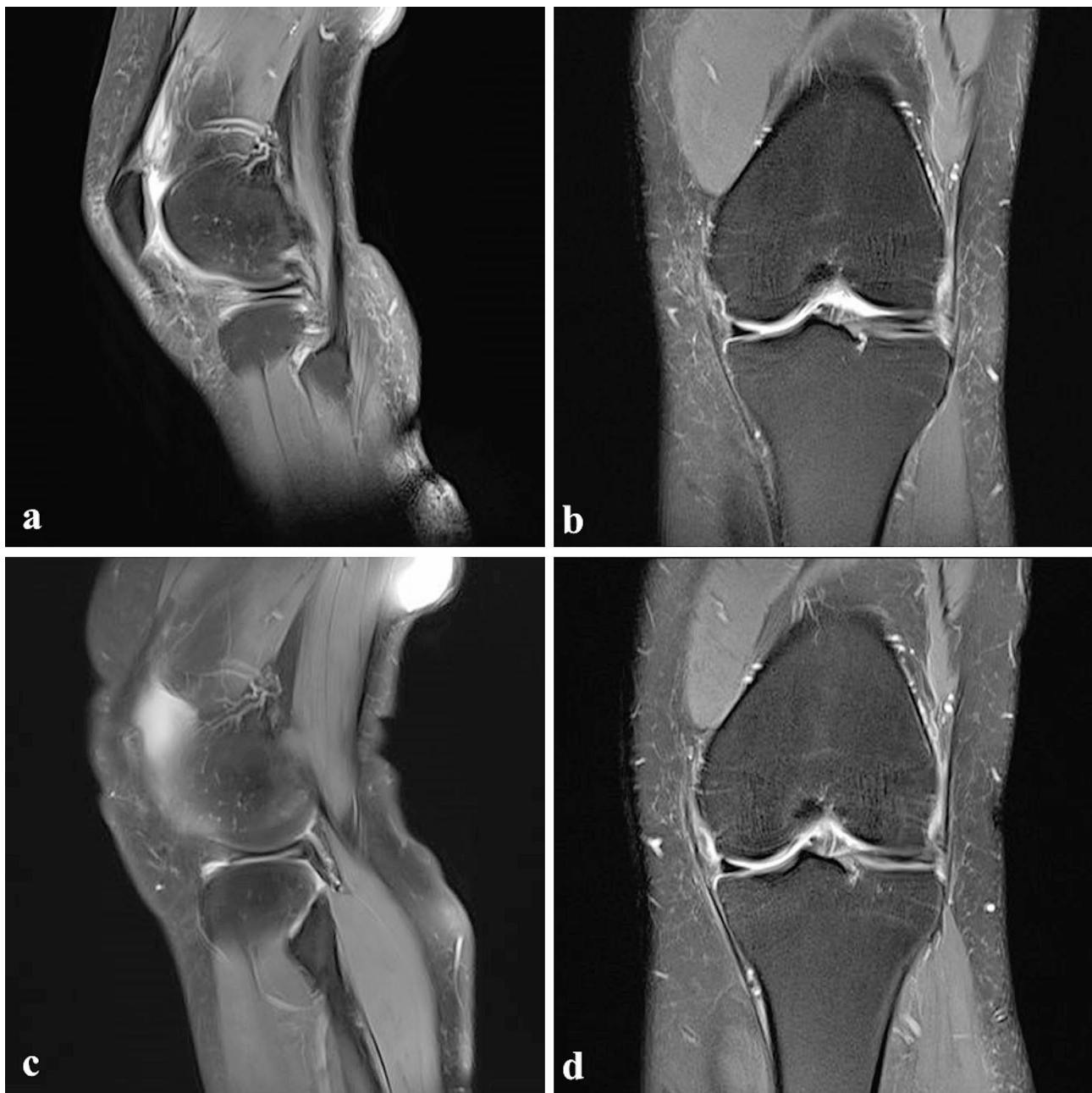
Fig. 1 (a and b) Horizontal tear of the involved LMAH is observed in a sagittal and coronal MRI in a 26-year-old female patient. (c and d) Sagittal and coronal MRIs after 3 months of surgery reveal the resected inferior leaf of the LMAH. LMAH, lateral meniscus anterior horn; MRI: magnetic resonance imaging

All patients were administered general anaesthesia. All surgeries were performed with the patient placed in a